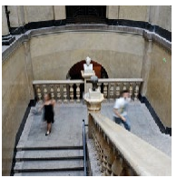
Art Nouveau Stair Case in the University Library