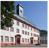
The Old University Building